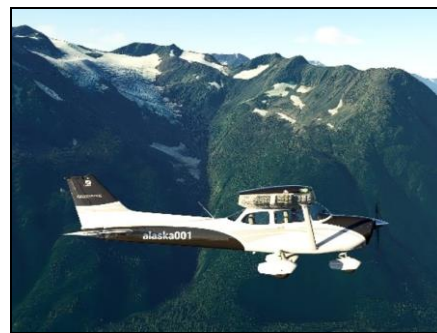
C172 Circling the town of Whittier